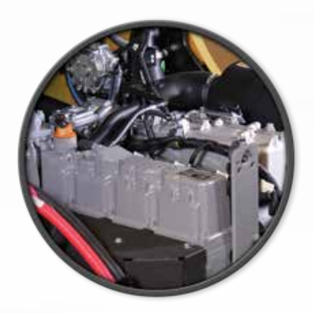
Kubota 3.8L LPG engine