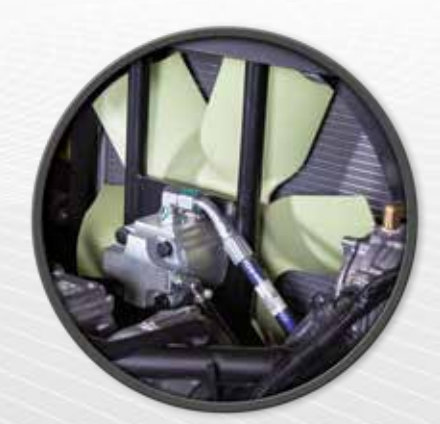
On-demand cooling system