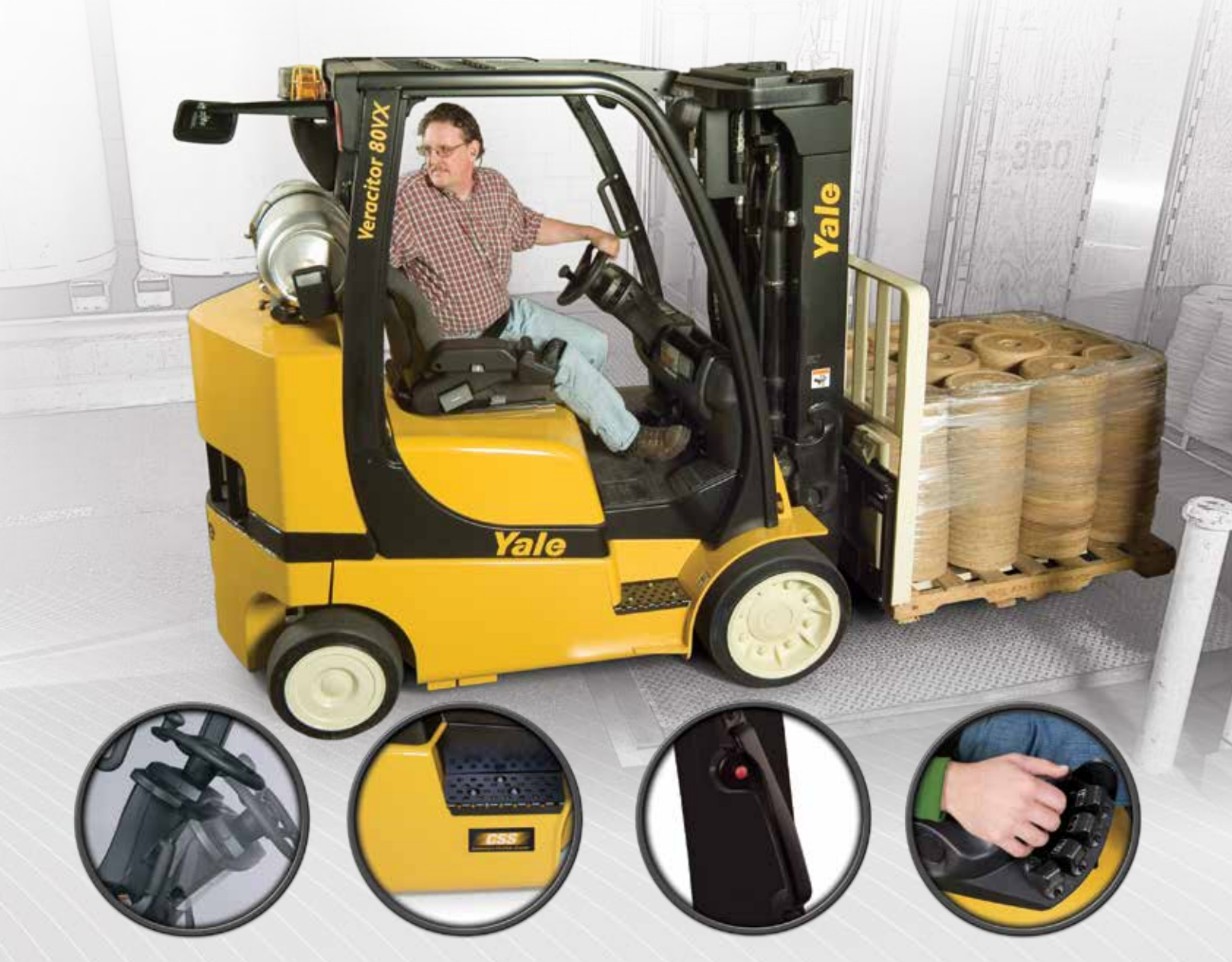
Infinitely adjustable steer column

Operator comfort is enhanced by the increased foot space in the well-designed operator's compartment. The isolated powertrain reduces noise and vibration helping to minimize operator fatigue and increasing operator productivity throughout a shift. Great operator visibility is afforded through the Yale® Hi-Vis™ mast. Innovative designs like our optimized step height, 3-point entry, increased shoulder clearance, easy right-side access and ergonomically-designed controls make this a comfortable ride for the operator.