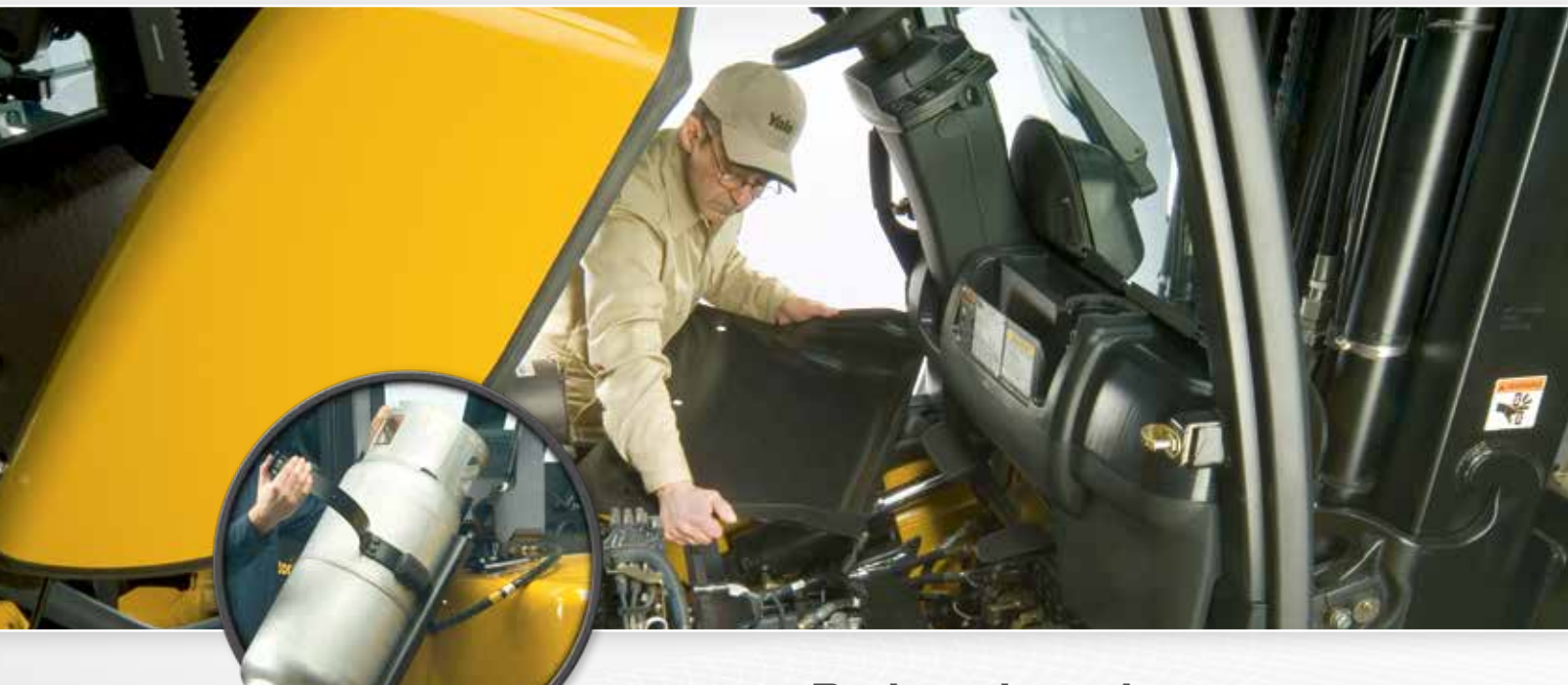
The optional swing-out, drop-down EZ-tank bracket swings out and drops down approximately 60 degrees for virtually effortless removal and installation of the LPG tank.

Not only is the Veracitor® VX series designed to require less maintenance, it is also designed to be extremely easy to service. From the rear-opening, one-piece hood and on-board diagnostics, to the reliable, most comprehensive parts availability in the industry, these trucks were designed with service details in mind. The cowl-to-counterweight access makes servicing fast, easy and convenient, making the Veracitor® VX series the new standard in truck serviceability.