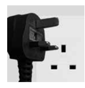
G Power Plug