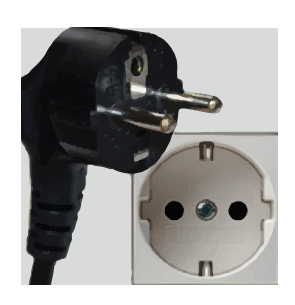
F Power Plug