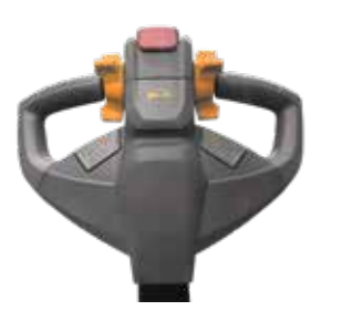
Handle (Standard) (Left & Right Handed)