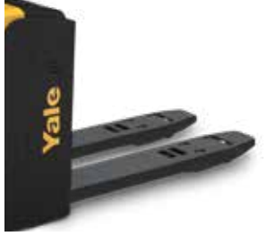
Entry Roller for Easy Operation