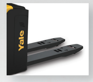
Entry Roller for Easy Operation