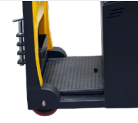
Spacious, Non-Slip Floor Plate