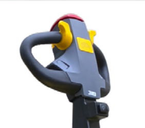
Adjustable, Ergonomic Tiller Head