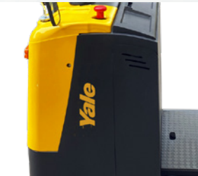
Easy Service Access via Front Cover