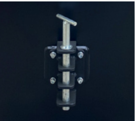
Rear Multi-Position Tow Coupling