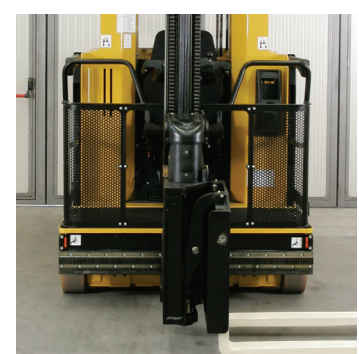
The Pantograph closed.