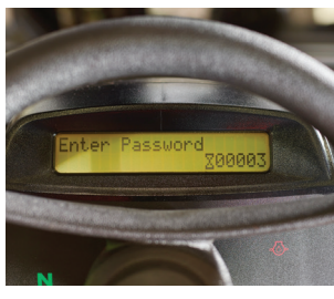
Operator password function

To celebrate the continued success of the Veracitor truck, we are introducing the Gold Edition for 2 to 3.5 tonne trucks.