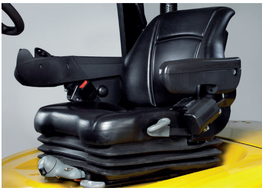
Best in class, full suspension seat

The optional EZ-Tank<sup>™</sup> Bracket is an added feature on the standard swing-out bracket. The LP tank swings out and drops down approximately 60 degrees for effortless removal and installation.