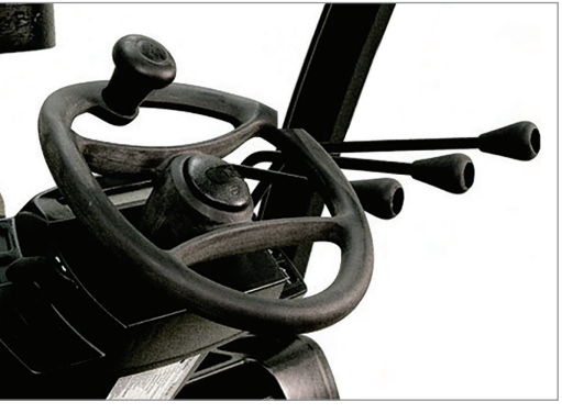
Ergonomically designed cab controls