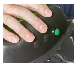
Return to Set Tilt control