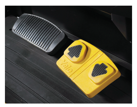
Yale two-way directional pedal

Add other operator friendly features such as the low noise hydraulic pump and cabin together with the seamless forward and reverse directional changes, controlled through a number of optional methods, including foot pedals or joystick control, and it's easy to see why drivers love the Veracitor VX – and employers love the way it increases their productivity.