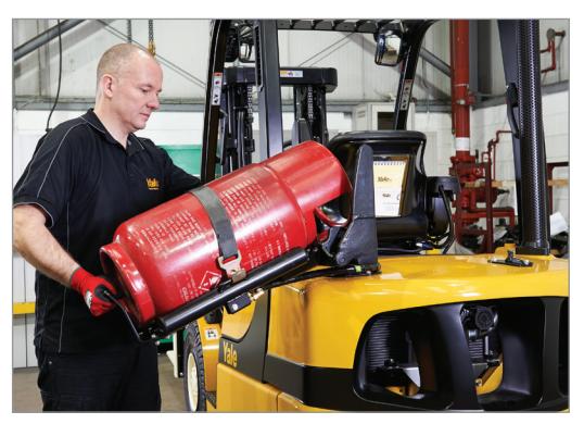
EZ™ – Swing out, drop down LPG bracket