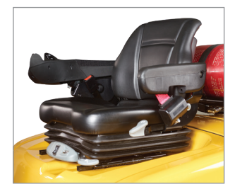
Vinyl Sears Air Suspension Seat