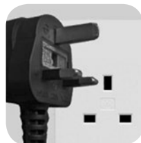
G Power Plug