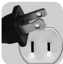
A Power Plug