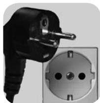
F Power Plug