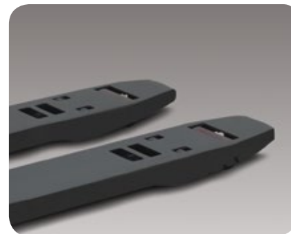
Entry roller for easy operation