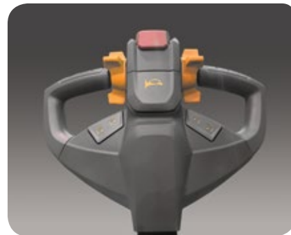
Handle (standard) left and right handed