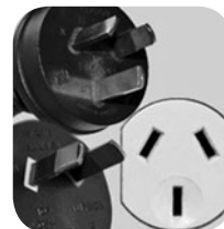
I Power Plug