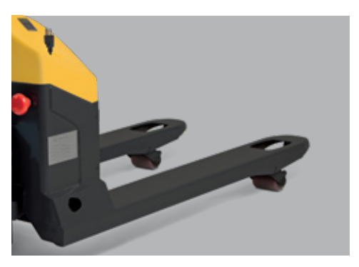
ENTRY ROLLERS HELP FACILITATE FORK ENTRY

Standard control handle offers left and right hand operation