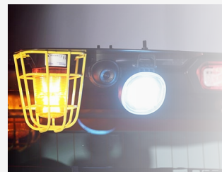
Lights and alarms