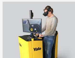
Virtual reality training