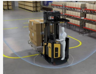
Operator assist technology

OPERATIONAL SAFETY REQUIRES CONTINUOUS ATTENTION AND ASSESSMENT, INCLUDING AN EXAMINATION OF THE AVAILABLE TECHNOLOGY.